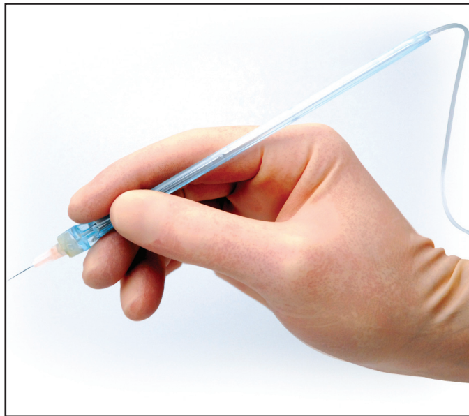
The Wand is preferred to the syringe because of its less daunting appearance

An early study showed that over 90 per cent of patients preferred The Wand to the syringe, purely on appearance.