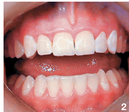
Fig. 2 Moderate caries-risk patient treatment focuses on keeping healthy biofilm and on remineralizing, repairing, and preventing white spot lesions.