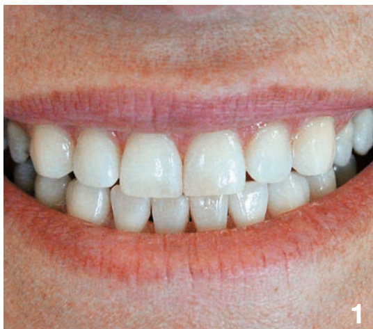
Fig. 1 Low caries-risk patient treatment is centered on maintaining primary oral health.