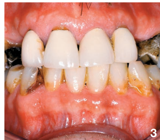
Fig. 3 High caries-risk patient treatment is a multi-phased approach involving repair, dietary counseling, and increased dental care.

The following are examples of clinical treatment strategies for patients who have low caries risk, moderate risk, and high risk.