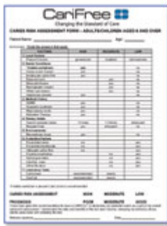
Figure 2. Caries Risk Assessment Form (CariFree [Oral BioTech]).

Fast-forward to 2006. We are once again in an age of rapid discovery as we now recognize that dental caries is not only a disease of bacterial origin, but it is a biofilm disease. 15 When the oral environment favors these bacteria, the biofilm population shifts from the normal healthy flora to the acidogenic and aciduric bacteria associated with dental caries. 11,16-19 A biofilm is present whenever there is fluid, a surface, and bacteria present. Species of bacteria attach to the surface and convert from planktonic to sessile. In the process they undergo up to 84 gene changes and are difficult to recognize as the same bacterium.