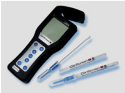
Figure 1. CariScreen (Oral BioTech) Caries Susceptibility Testing Meter and Swab.